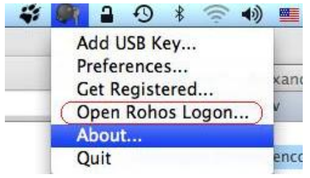
screen shot 6

In the main program's window click on drop-down box and choose one of the USB Key removal actions (e.g. Lock the desktop, Log out, Sleep, etc.)