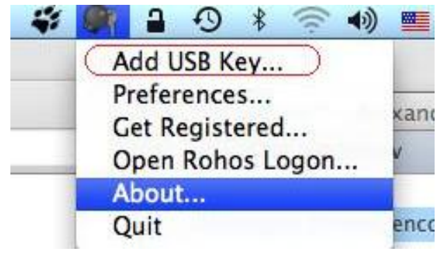
screen shot 3

• To set up the USB key click on Rohos icon in status bar and then "Add USB Key...".