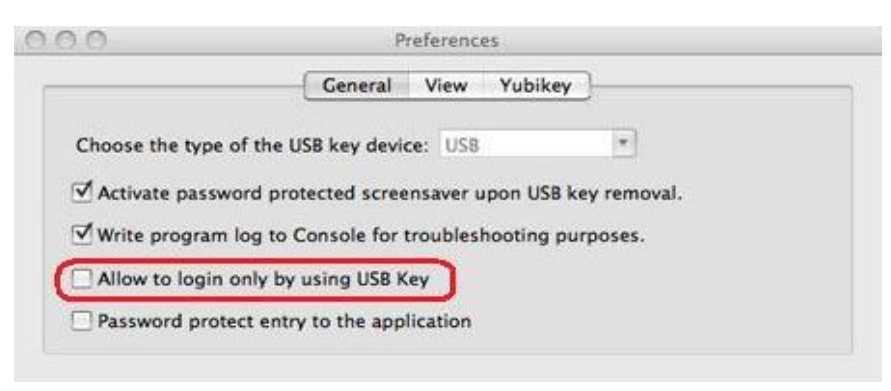
screen shot 11

Check in "Allow to login only by USB Key".